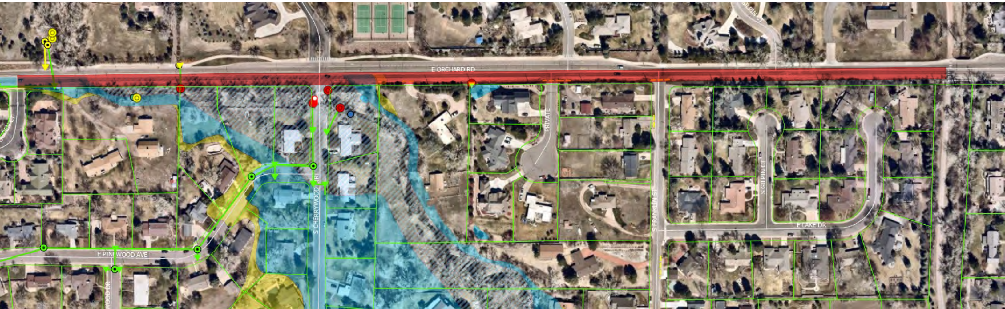
ORCHARD ROAD WIDENING OGDEN COURT TO HIGHLINE CANAL