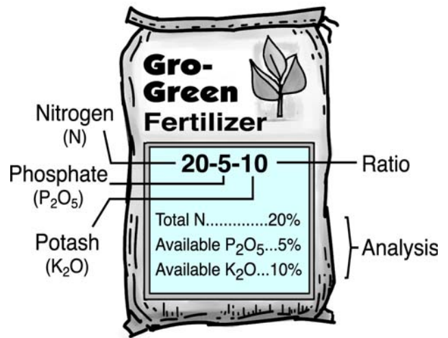
Table 1: Pounds of fertilizer required for various lawn sizes using a 1 pound N/ 1,000 sq. ft. application.

money and potentially harmful to drinking water supplies. Excess fertilizer also increases lawn growth, requiring more frequent mowing.