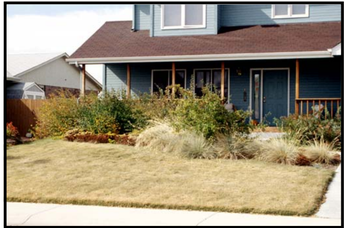
A yard under xeriscape can be maintained with less water and fertilizer in many situations. (Design/photo by Grant Reid.)

Alternatives to Kentucky blue grass, such as buffalograss, blue grama grass, and tall, turf-type fescue can provide a beautiful lawn that requires less resources. However, be aware that each alternative grass has its own advantages, disadvantages, and cultural needs. Often, homeowners plant grass in areas that are too shady, or that have steep slopes or poor soils where lawn grass just doesn't grow well. More fertilizer and water are not the answers in these cases. It's usually best to replace this grass with hardy ground covers, ornamental bunch grasses, or mulch.